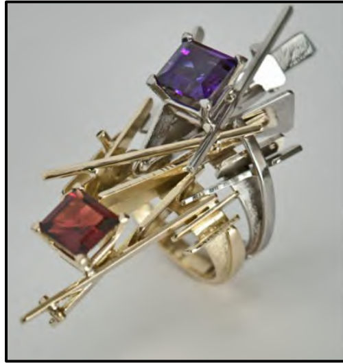
FIGURE H: Deconstructivism ring by Anneke Schat (The Netherlands), circa 2015.