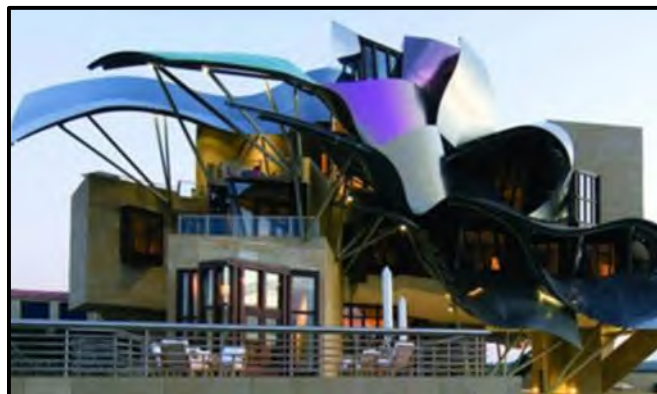
FIGURE G: Marqués de Riscal Hotel and Winery complex by Frank Gehry (Spain), 2006.