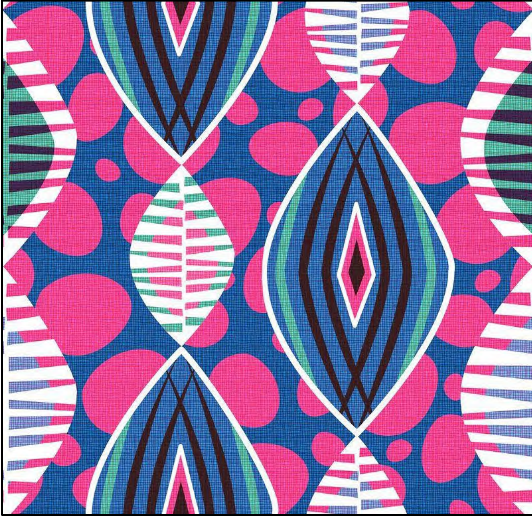
FIGURE A: Textile design in honour of Black History Month by Spoonflower (USA), 2020.

1.1.1 Analyse the use of the following elements and principle in FIGURE A above: