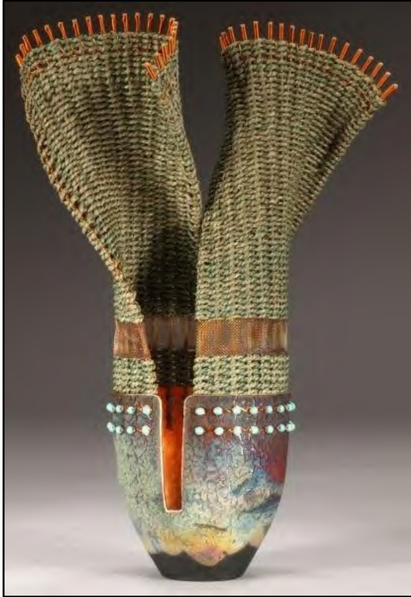
FIGURE B: Raku-fired ceramic and basketry vessel by Willow Bend Studio designers Marc Jenesel and Karen Pierce (USA), 2018.

1.2.1 Analyse the design in FIGURE B above by referring to the following: