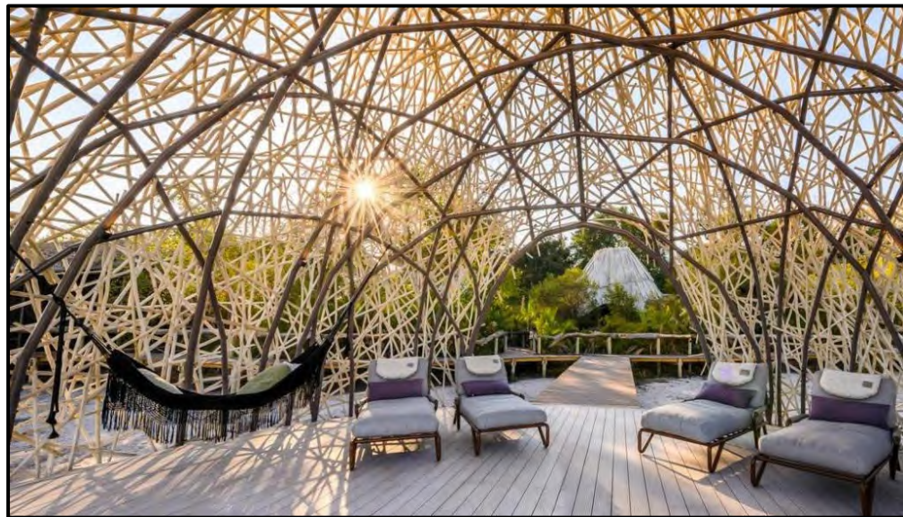
FIGURE K: Bird's Nest pool gazebo (an outdoor structure that offers shade from the sun and can be used for outdoor entertaining), Jao Camp Okavango Delta Lodge (Botswana), 2022.