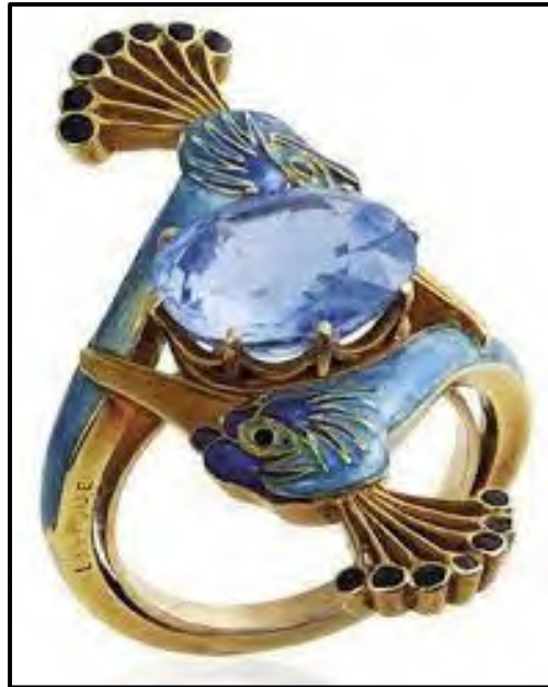
FIGURE I: Art Nouveau ring by René Lalique (France), circa 1900.

Write an essay (at least ONE page) in which you compare the rings in FIGURE H and FIGURE I above and explain how they are typical of the movements they represent.