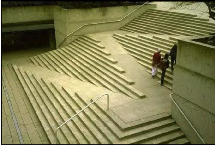
FIGURE J: Rockson Square staircase by Arthur Erickson Architects (Canada), 1983.

5.1.1 Discuss TWO positive and TWO negative functional design features of the staircase in FIGURE J above.