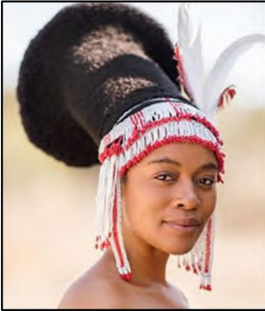
FIGURE D: Traditional amaZulu hairstyle (South Africa), 2022.