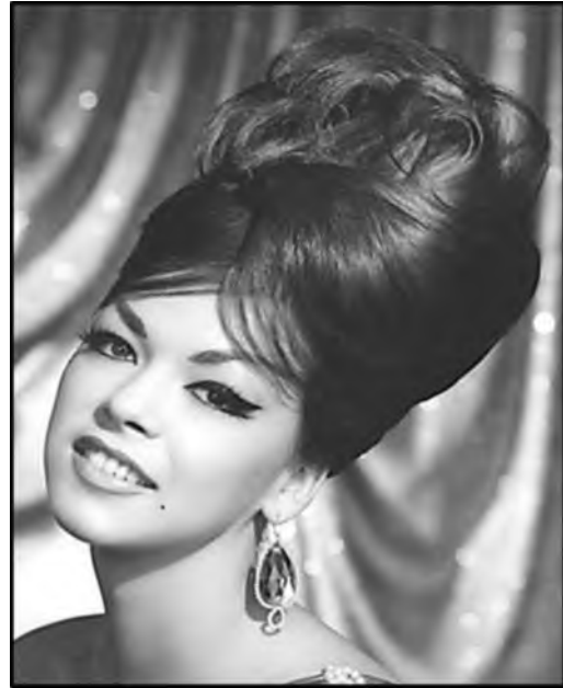
FIGURE E: Fashionable beehive hairstyle (USA), 1960s.

Write a paragraph in which you compare the hairstyle designs in FIGURE D and FIGURE E with reference to the following: