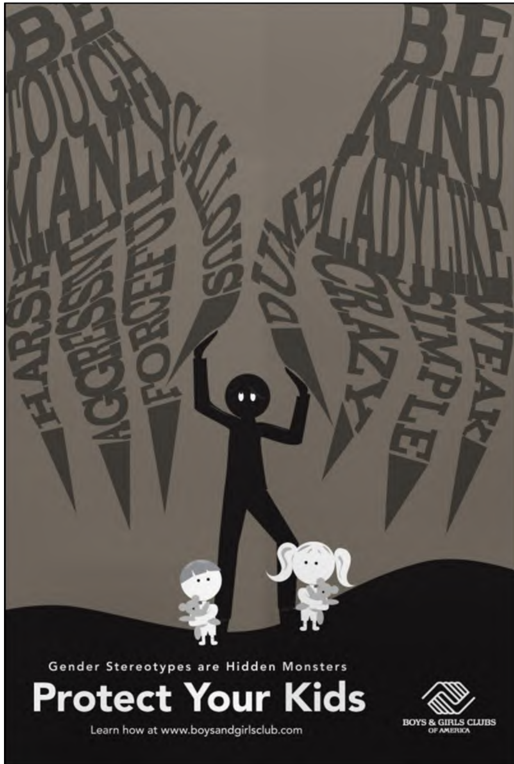
FIGURE C: Gender stereotype campaign poster by Lindsay Helms (USA), 2017.

Explain how imagery and text is used to convey the message of gender stereotyping in FIGURE C above.