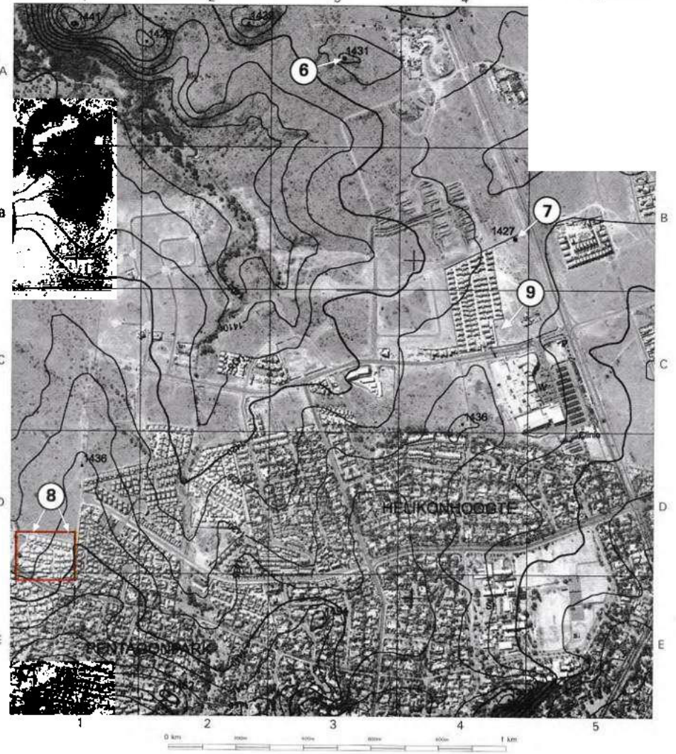
CONTOUR INTERVAL 5 METRES - KONTOURTUSSENRUIMTE 5 METER