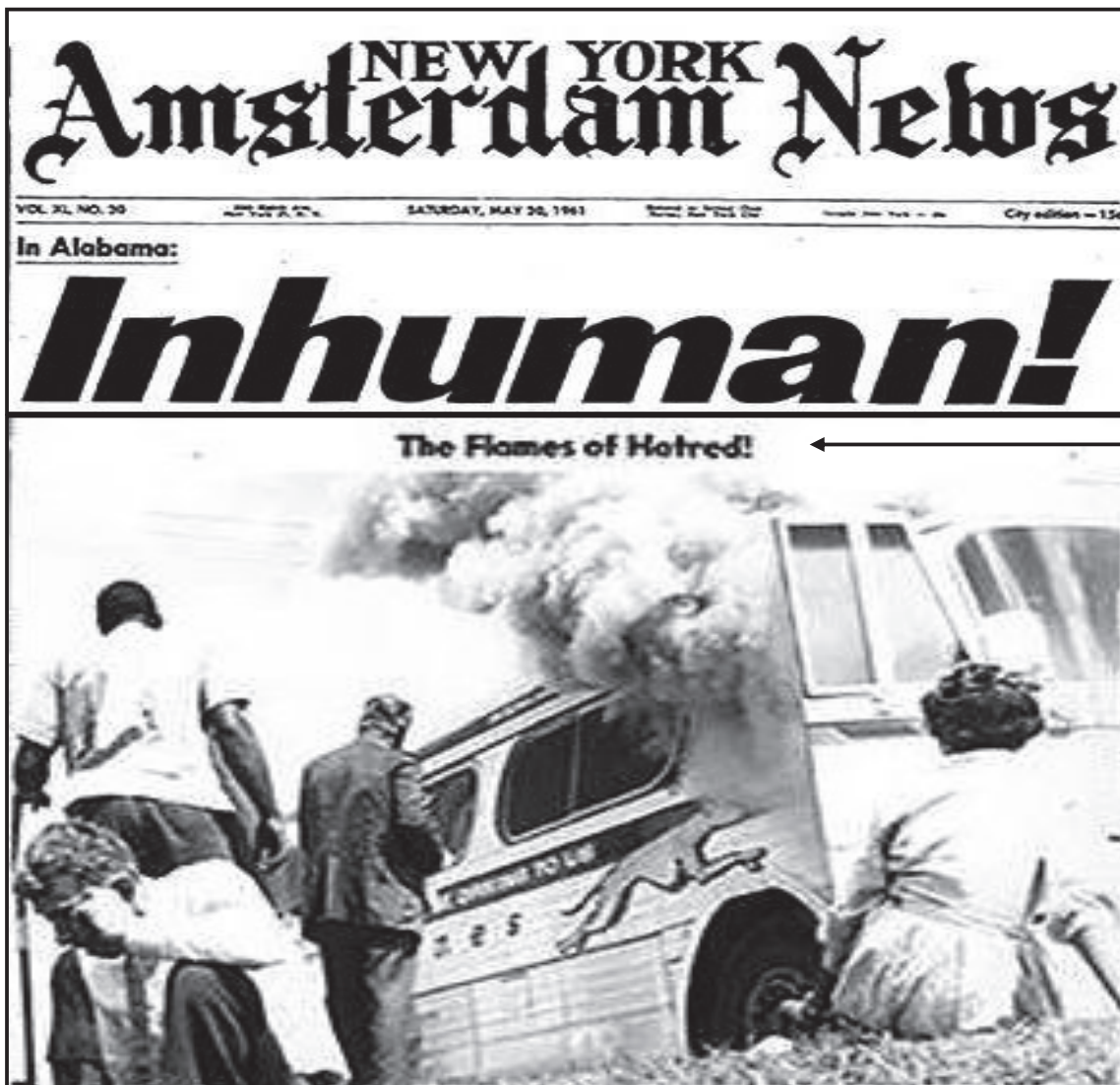
[From NEW YORK Amsterdam News , 20 May 1961]

The newspaper article below was published in the NEW YORK Amsterdam News on 20 May 1961. It used a photograph to effectively report on the challenges that Freedom Riders encountered in their demonstration against racial segregation in the United States of America.