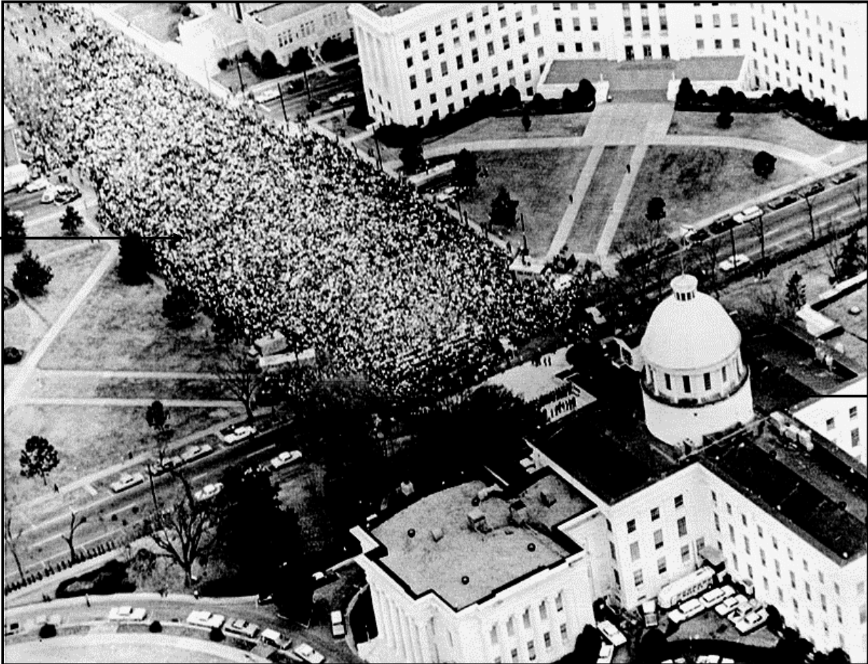
[From The Civil Rights Movement: A Photographic History by S Kasher]

This is an aerial photograph taken at Dexter Avenue in front of the Alabama state capitol in Montgomery on 25 March 1965. It shows some 25 000 marchers who managed to arrive at Montgomery on their third attempt after leaving Selma on 21 March 1965.