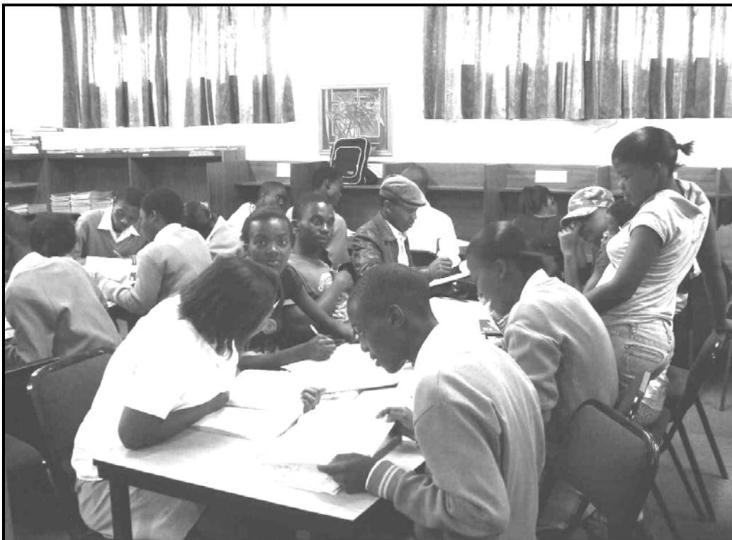
[Ithathwe kuvimba wabevi]

QAPHELA: Phendula yonke imibuzo usebenzisa amazwi akho ngaphandle kokuba ucelwe ukuba ucaphule.