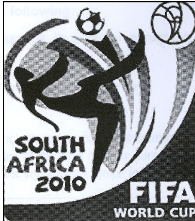
The official emblem for the FIFA World Cup

The emblem depicts the energy and vigour of the African continent. The inspiration for the footballing figure over the shape of Africa is drawn from Khoi-San rock paintings, and is also representative of South Africa's deep and long history.